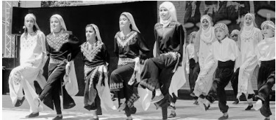
Palestinian “dabke” folk dance, poetry, and art often depict themes of strong connections to the land, resilience, and resistance in the face of colonization and occupation.