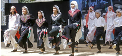
Palestinian “dabke” folk dance, poetry, and art often depict themes of strong connections to the land, resilience, and resistance in the face of colonization and occupation.